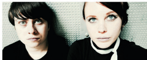
Lucas & King

From his base in the Welsh valleys, Rob first burst onto the music scene in early 2013 with the release of a debut album titled Let it Go , mixed and co-produced by Grammy-nominated producer Simon Tassano. The success of that album led to folk & acoustic festival appearances & touring the UK and Europe.